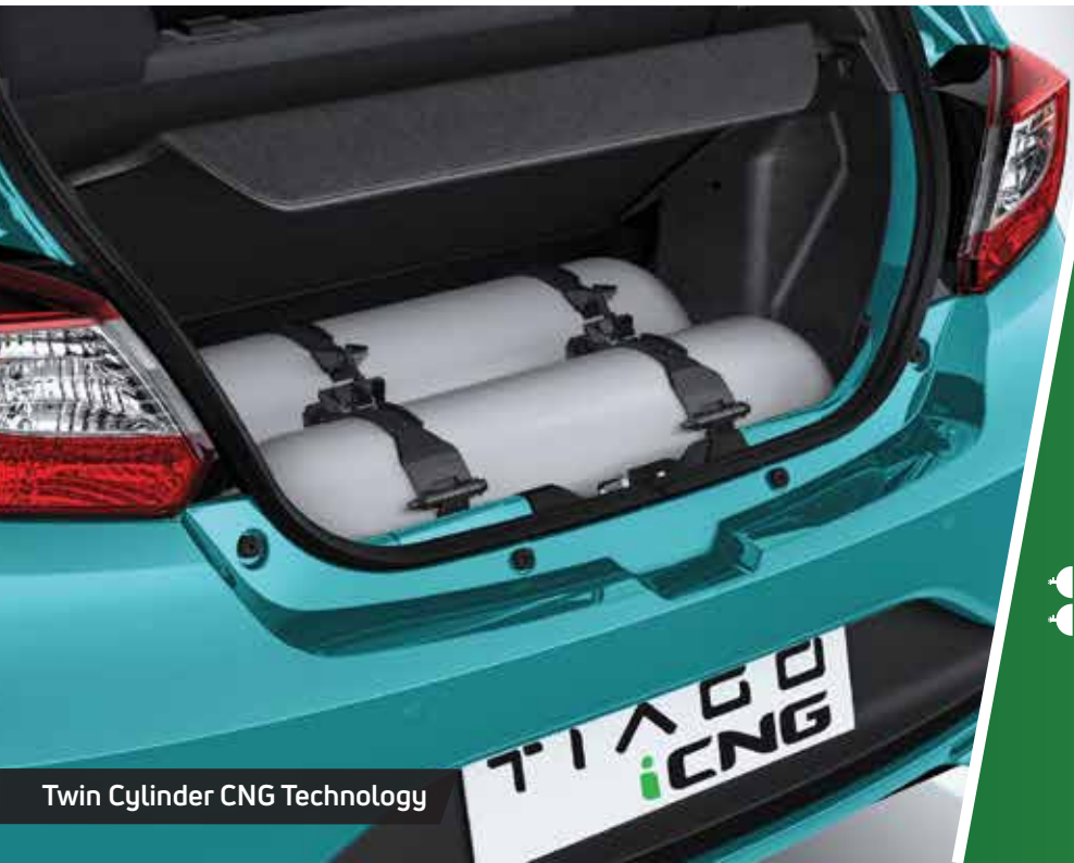
Twin Cylinder CNG Technology