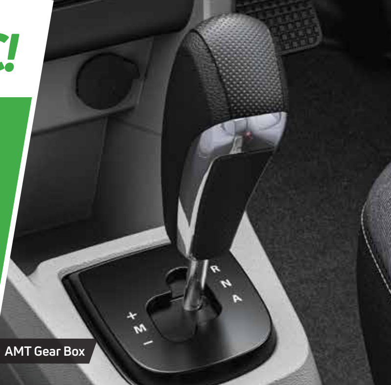
AMT Gear Box

#1* Refers To Introduced By Tata Motors Passenger Vehicles And Industry Represent The Passenger Car Segment.