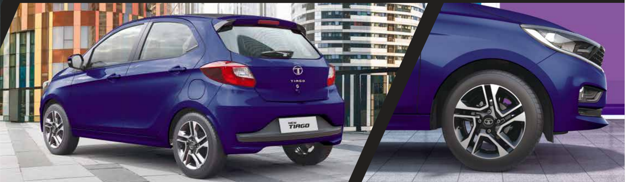
Boomerang Shaped Tail Lamps with Rear Defogger & Wiper Trendy Dual Tone Alloy Wheels