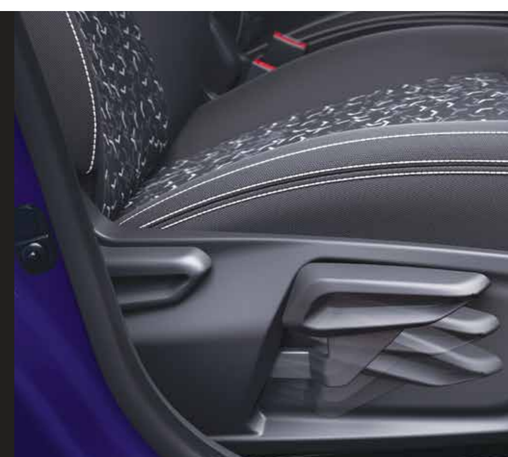
Height Adjustable Driver Seat