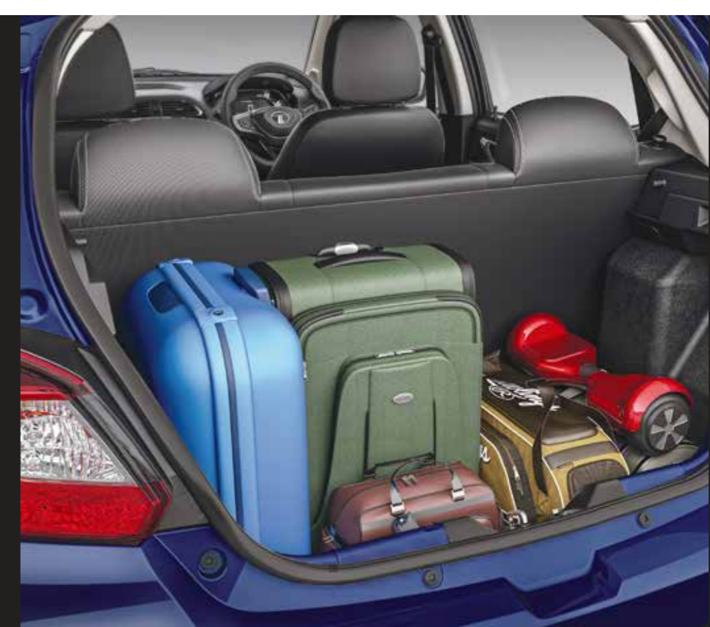
242 l Boot Space