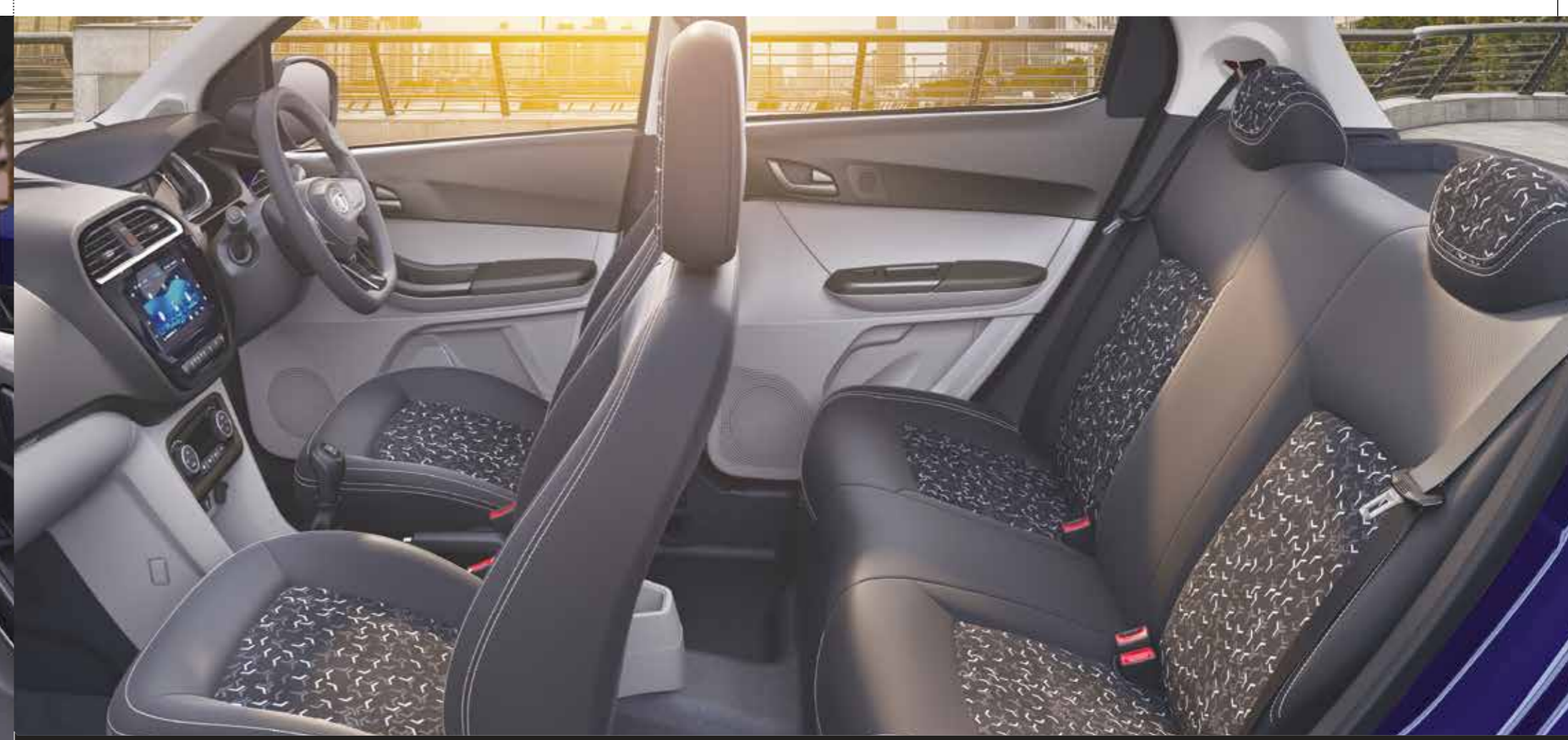
Classy & expansive space with a premium dual tone interior theme. Premium body-hugging seats with elegant dual tone, tri-arrow designed upholstery.