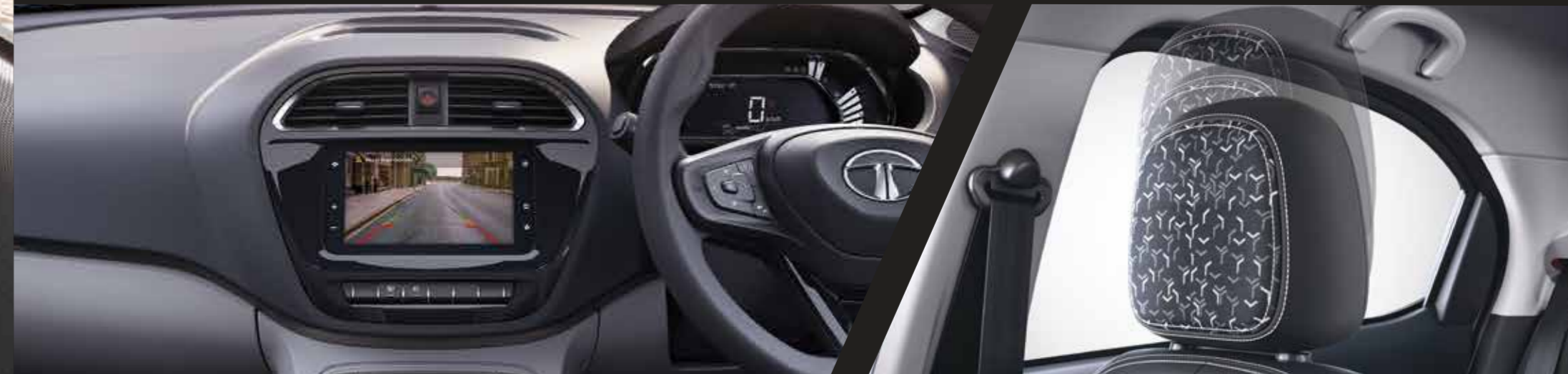
Adjustable Front Headrest